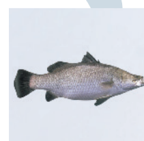
Barramundi Whole round