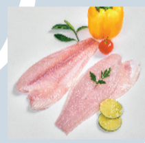
Basa Untrimmed Fillets