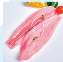
Basa Semi-trimmed Fillets Pink Meat