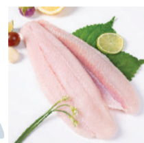
Basa Semi-trimmed Fillets