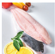
Basa Skin on Fillets