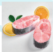
Basa Steak Pink Meat