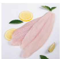
Basa Welltrimmed Fillets