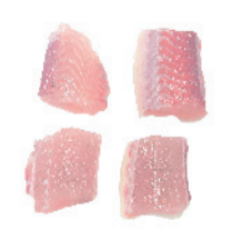
Basa Untrimmed Cubes