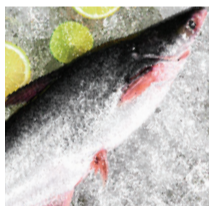
Basa Whole round