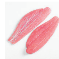
Basa Welltrimmed Fillets Pink Meat